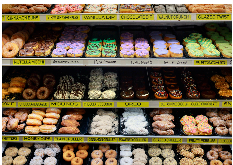
The shelves are filled with a wide variety of donuts at the Dandee Donut Factory in Pompano Beach on Tuesday.