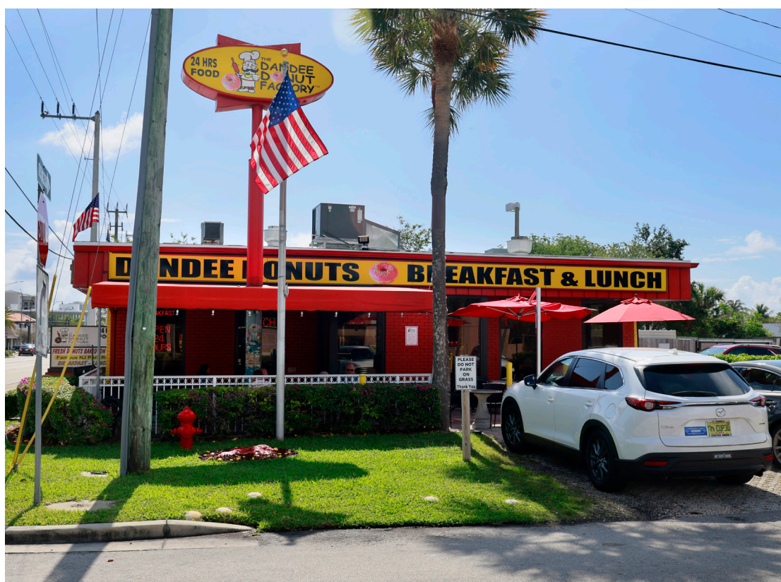
The original Dandee Donut Factory location in Pompano Beach. The Dandee Donut Factory has three South Florida locations: Pompano Beach, Deerfield Beach and Margate. It was voted as Best Donuts in our Best of South Florida Dining series.